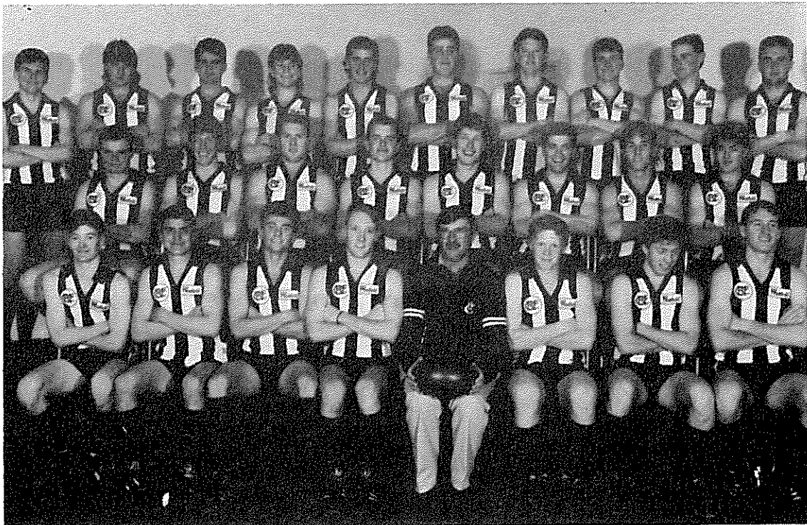
Under 19 - Grand Finalists 1991