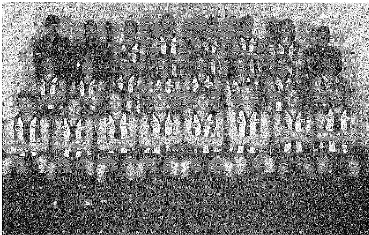
Reserve Grade - Premiers 1991