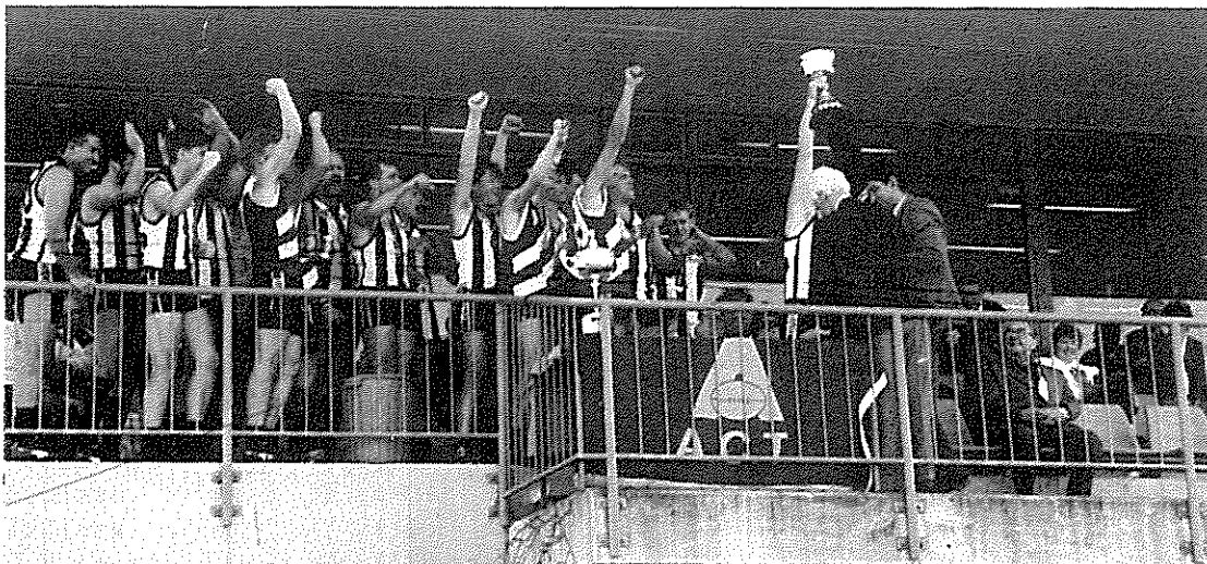
Reserve Grade team receiving Premiership Cup