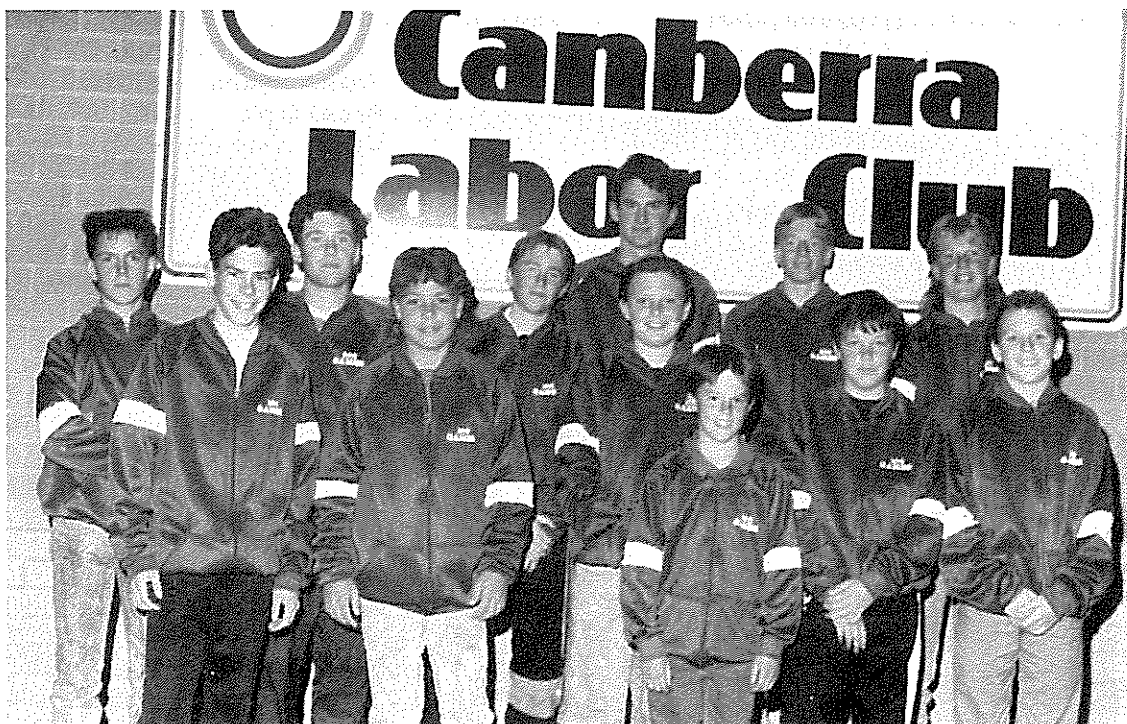
Junior players who reached milestones of 100, or 200 games, after presentation of jackets at the Junior Presentation Night