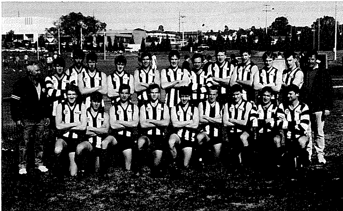
First Grade Team 1991